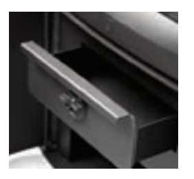
Large capacity ash pan

Aura 1 has a large fire chamber with ample fuel storage space beneath the innovative door which opens when pressed gently.