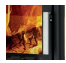
Ergonomically designed handles