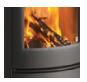
Combustion chamber designed to make it easy to light and clean the stove