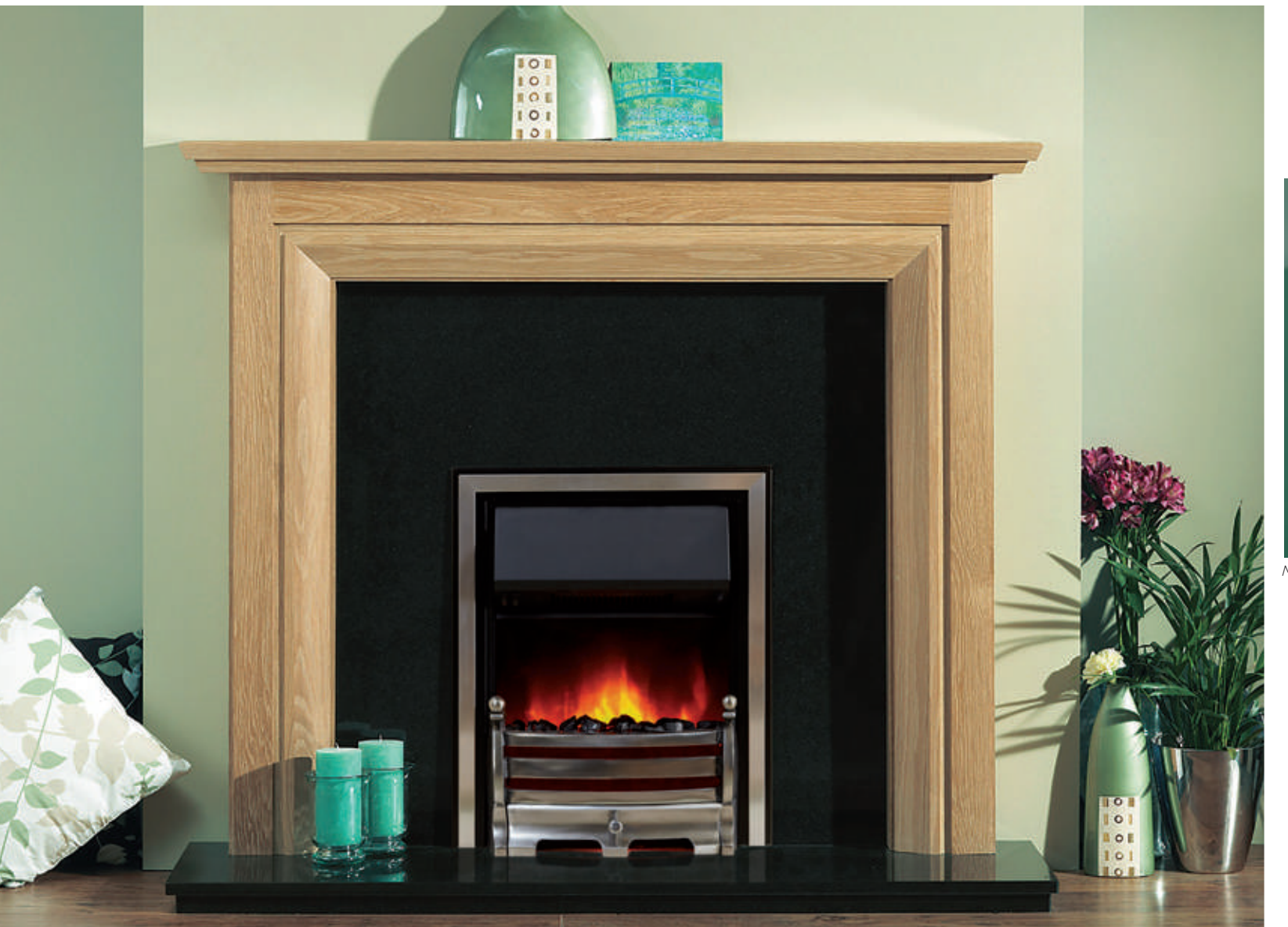
Matlock:Waxed Oak with Oak Inlay