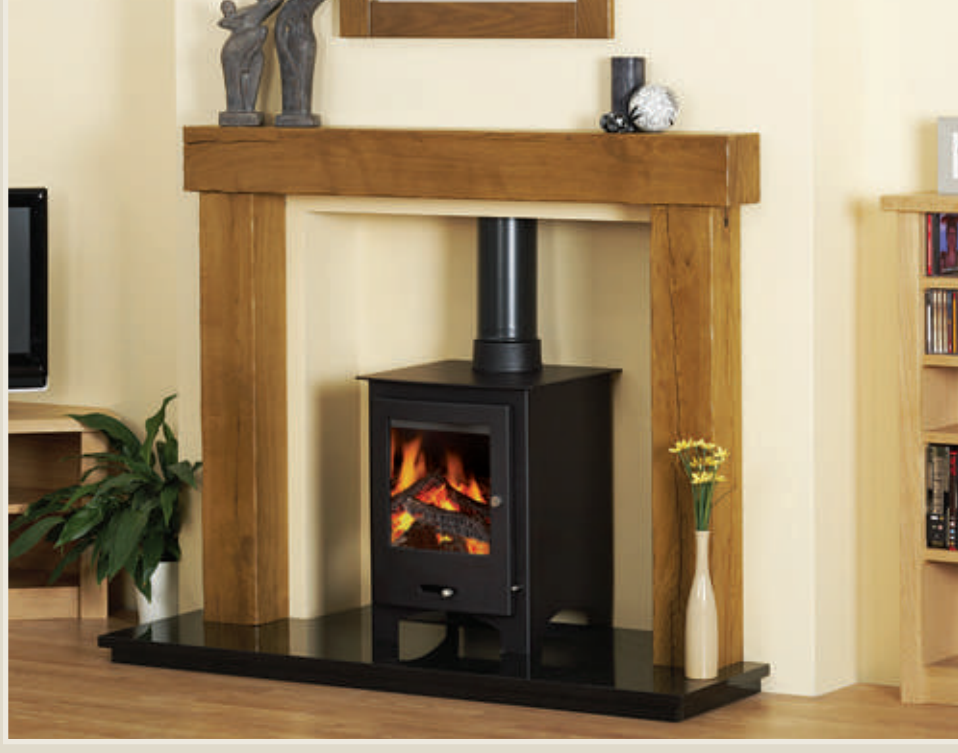
Beamish: Rustic Oak in a Light/Medium Finish