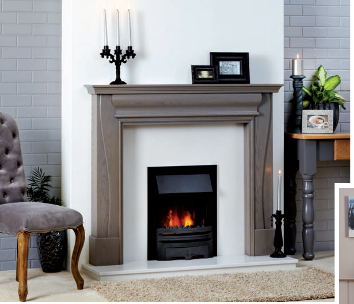
Charlotte: Grey Wash on Oak Fire: Focusflame Black Grace