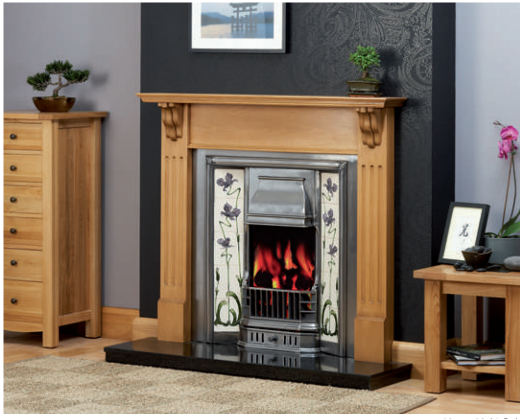
Vyner: Light Oak