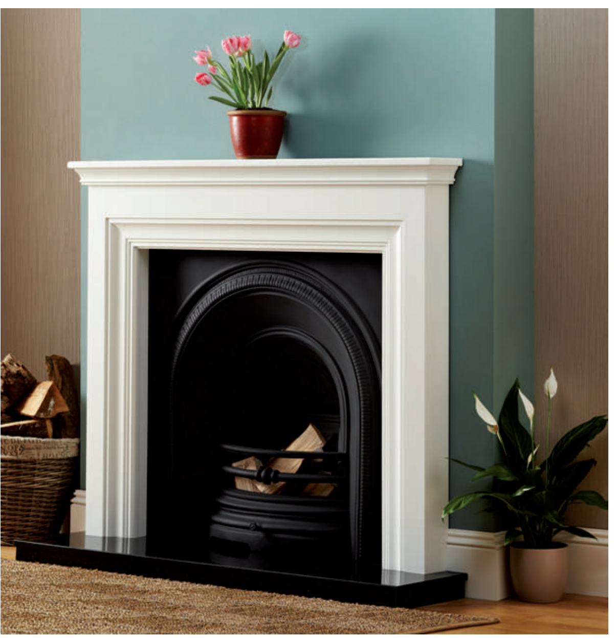
Emmerdale: Antique White