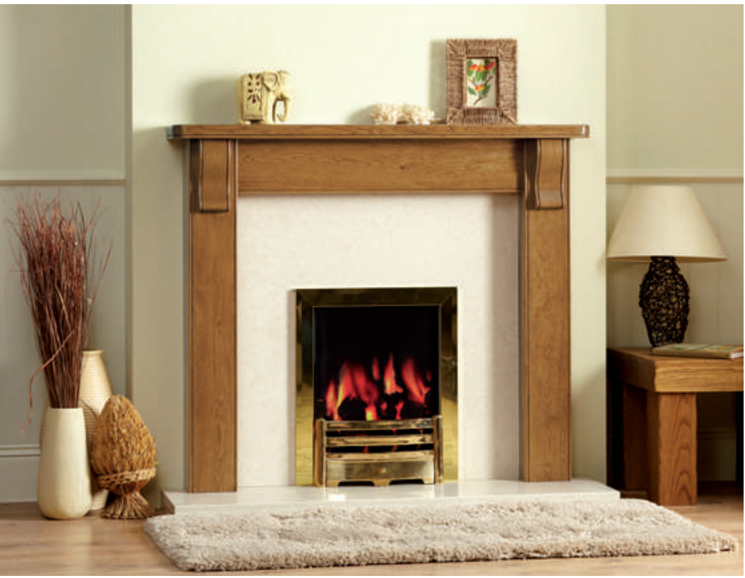
Coburn: Light/Medium Oak