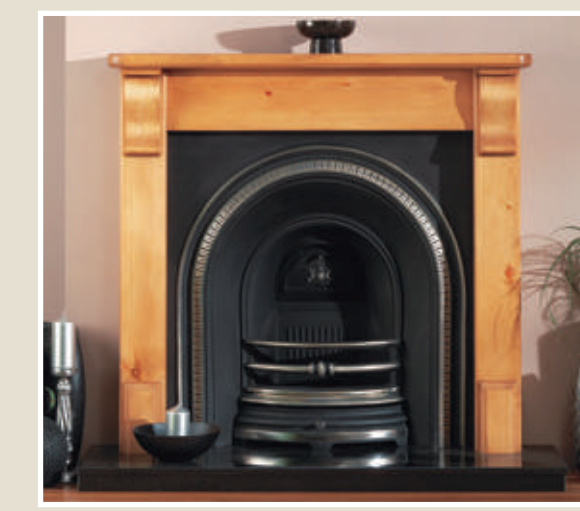
Small Plain Corbel: Canadian Pine

The surrounds on pages 39-43 are manufactured from MDF and veneered MDF and most are available in a wide choice of finishes including mahogany, various shades of oak and most of the painted finishes. Solid pine in a waxed finish is also available.