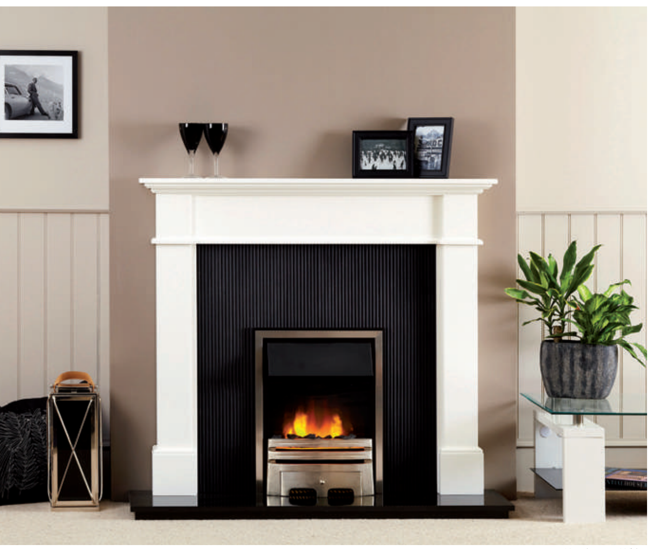
Kensington: White Fire: Focusflame Stainless Grace