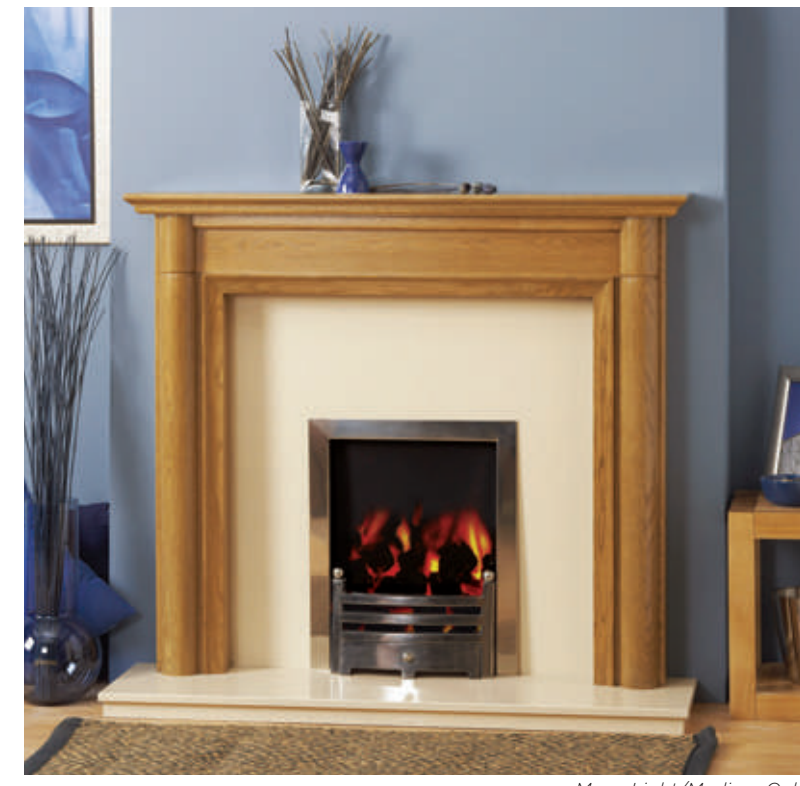
Mere: Light/Medium Oak