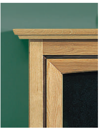
1atlock: Waxed Oak with Walnut Inlay

A smaller electric suite version of this surround is featured in the "Focus on Electric" brochure.