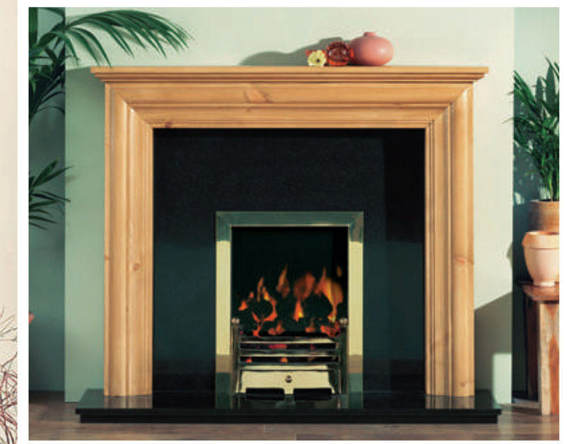
Emily: Canadian Pine