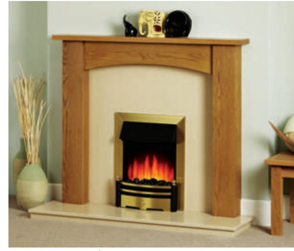
Justine Arch: Light/Medium Oak