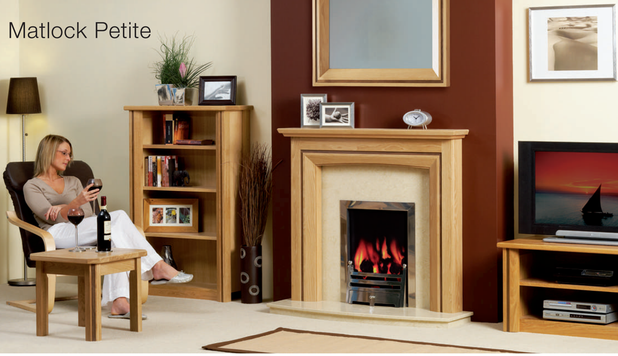
Matlock Side Table and Bookcase: Waxed Oak with Walnut Inlay

METRIC IMPERIA 1187 46 3/4 190 7<sup>1</sup>/<sub>2</sub> 1035 40 3/4 825 32<sup>1</sup>/<sub>4</sub> 762 30 1092 43 28 11/8