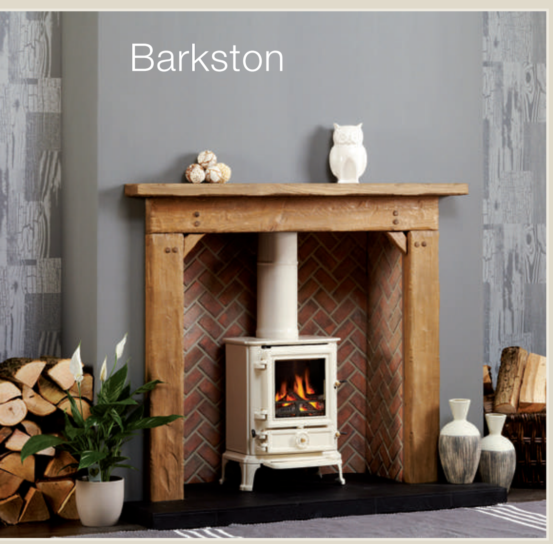
Barkston: Extremely Aged Oak in a Light/Medium Finish