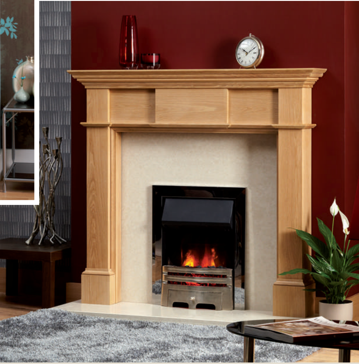
Weymouth: Waxed Oak