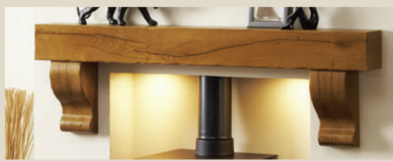
Deep Beam with Corbels: Rustic Oak in a Light/Medium Finish