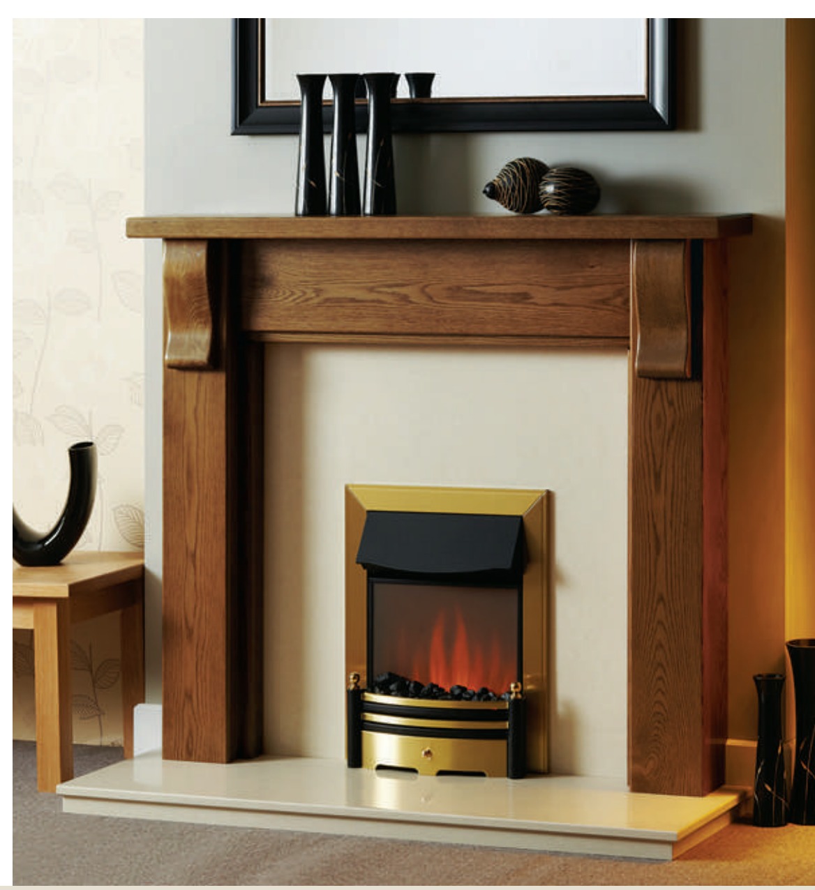
Montreal: Medium Waxed Oak