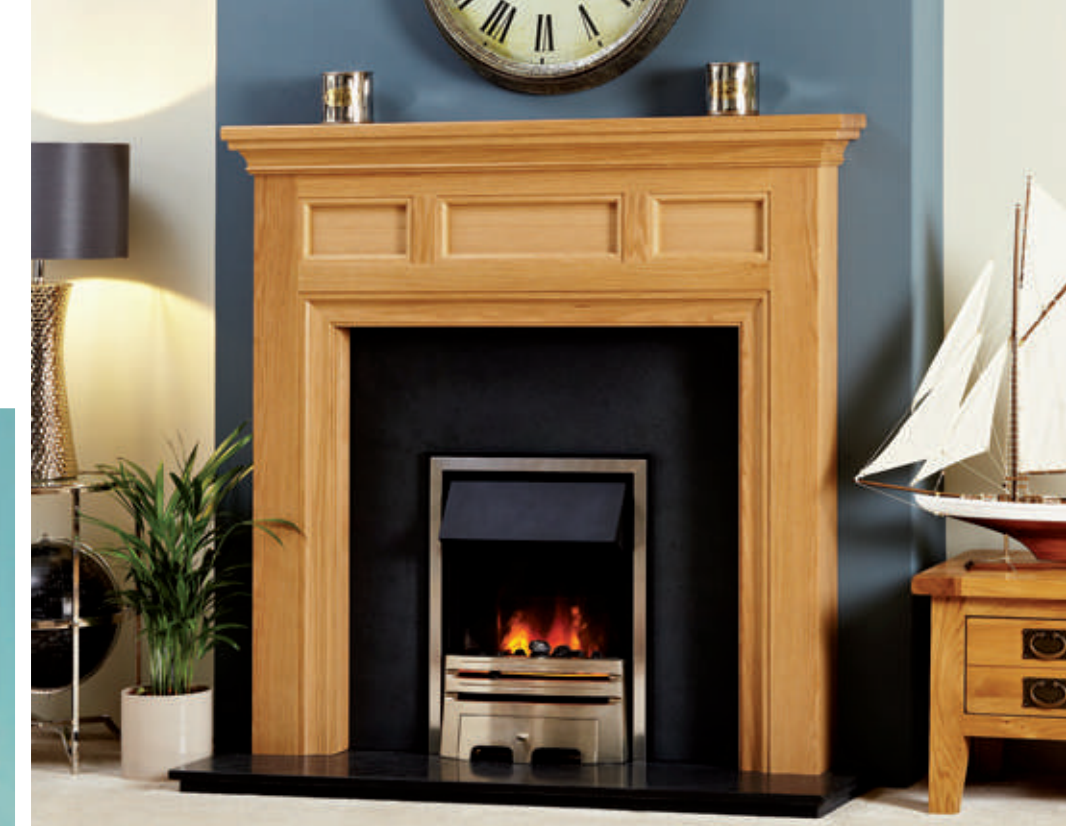
Paris: Waxed Oak Fire: Focusflame Stainless Grace

See pages 2-3 for more inspirational colours and finishes.