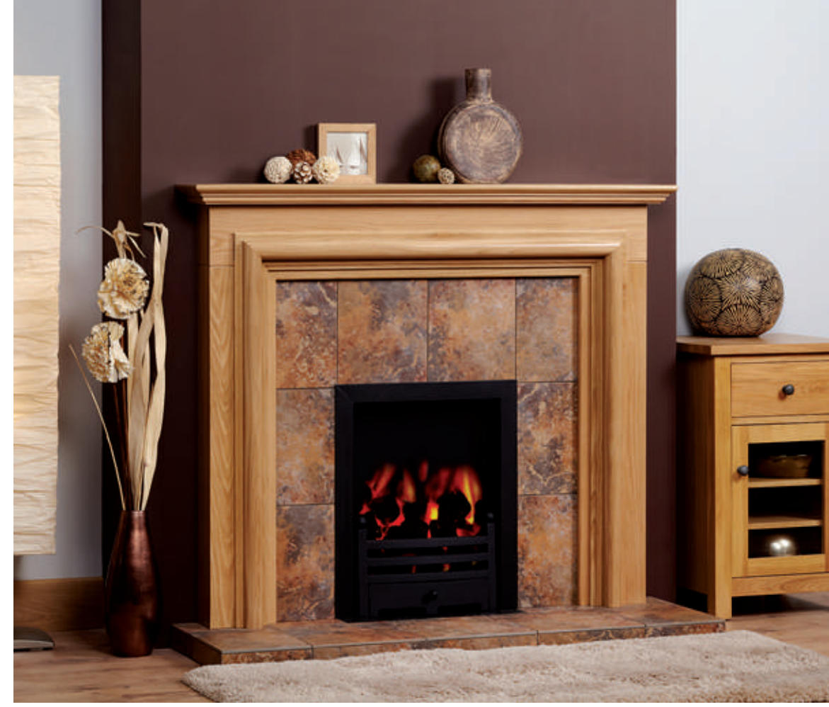
Ullswater: Light Oak Displayed with Tiles from Beardmore and Smith