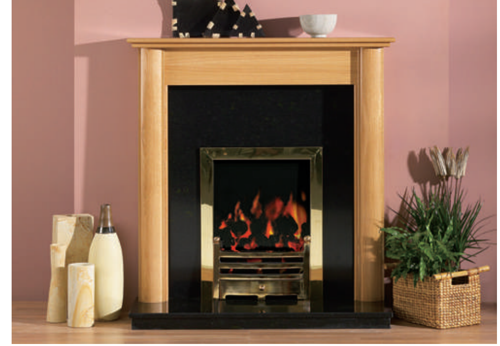
Marie: Oak Finish Available in all Finishes