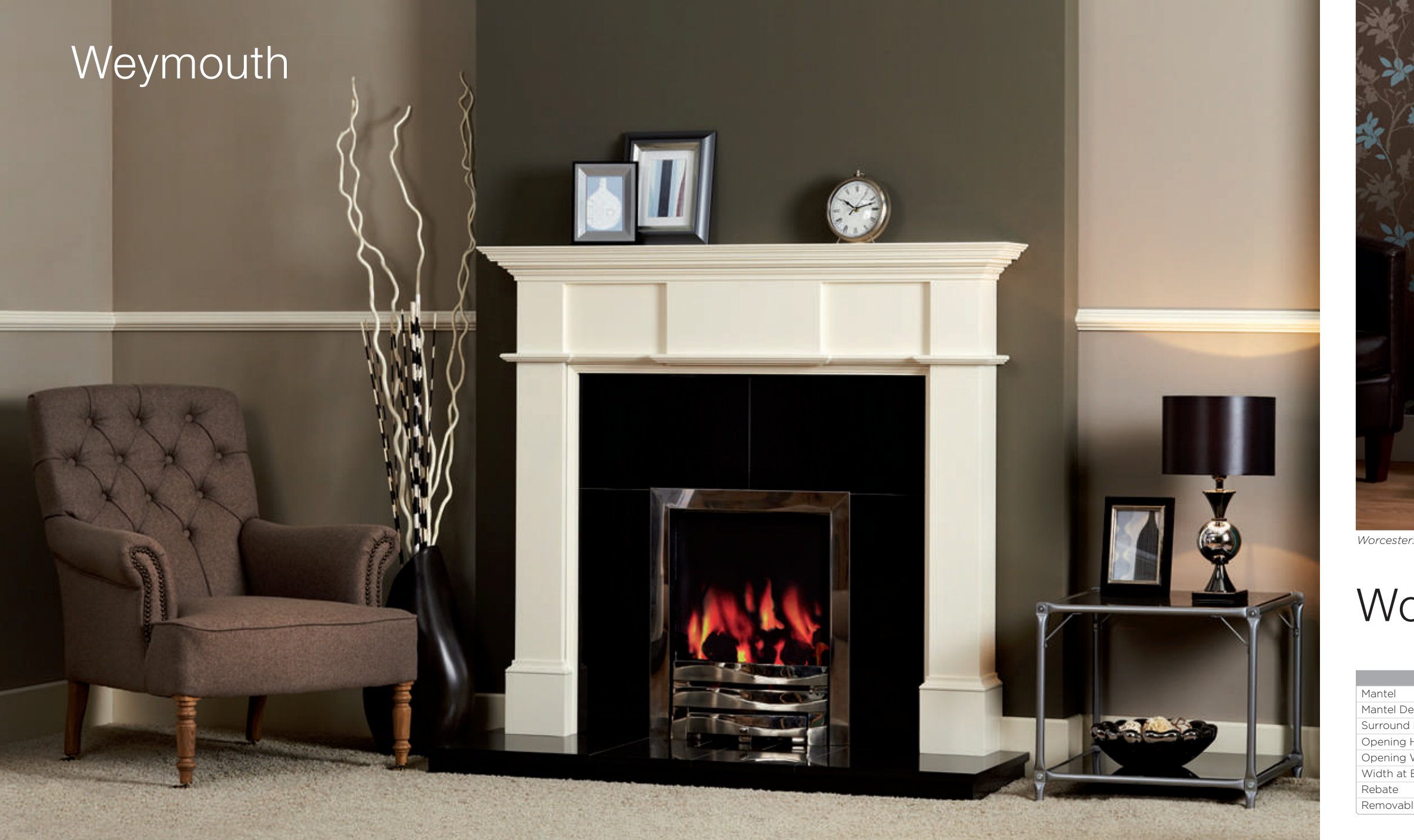
Weymouth: Antique White Displayed with Granite from Beardmore and Smith